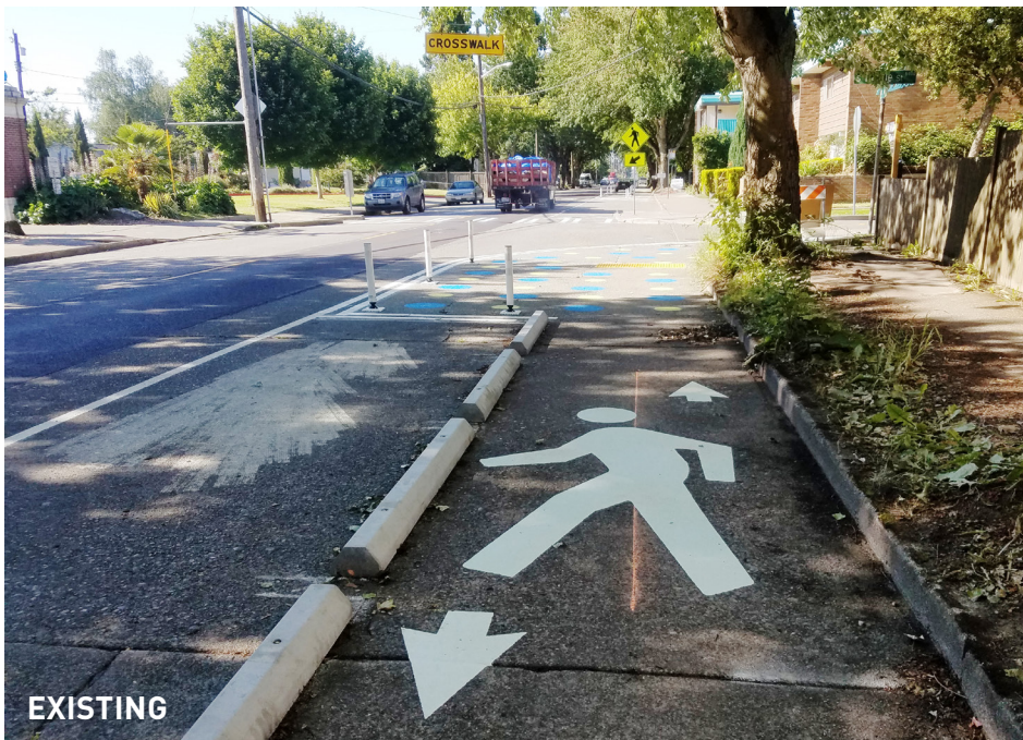
Temporary walkway where we'll build the permanent concrete sidewalk

We're also planning to incorporate decorative street designs into this project – see website for details.